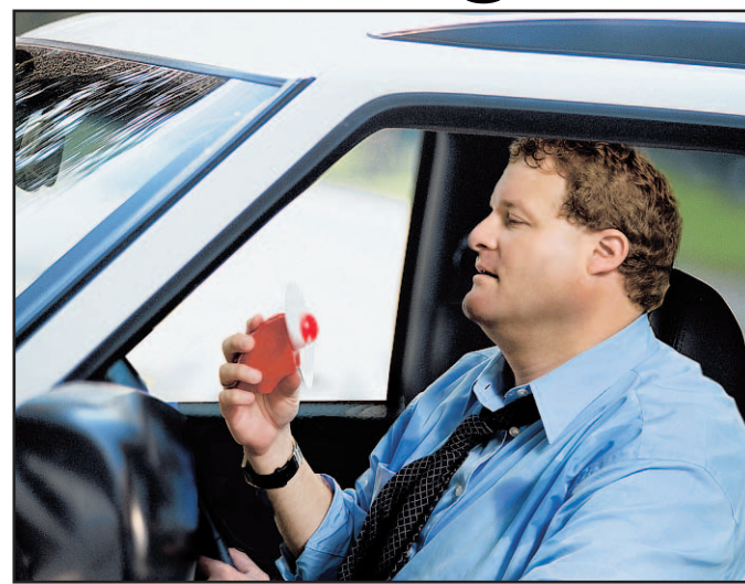
The dog days of summer are here. How well is your car air conditioner working?

your vehicle, including the air conditioning system, may help forestall costly repairs. Many automotive service shops offer A/C inspection specials during